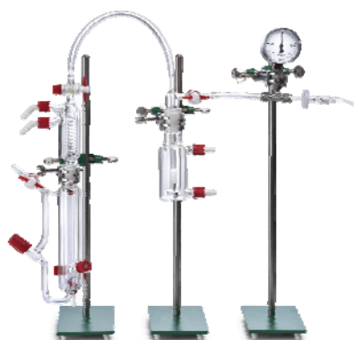
Liquid purge vessel